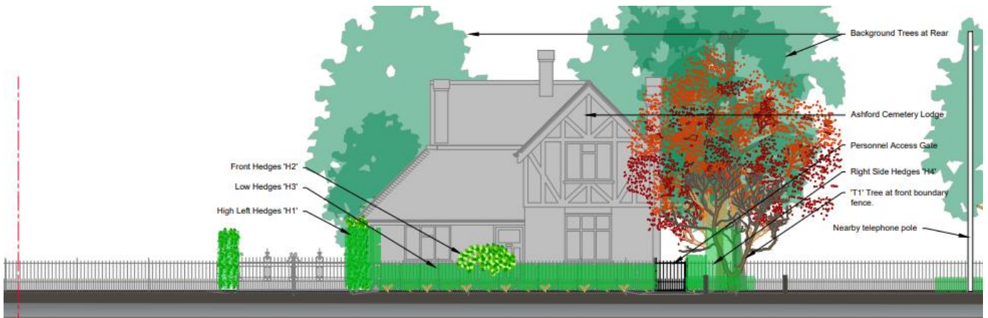
STREET ELEVATION - AS EXISTING